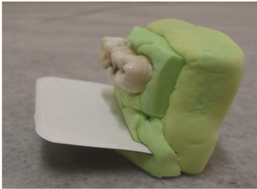
Fig. 1. Sample teeth in contact mounted in a silicone block with PSP [15]

Some recent studies [16,21,23] evaluated the effect of different times of erasing data from PSPs on the quality of inter-proximal caries detection; Melo reported no effect on caries detection ability [16]. Result comparison between Melo's study and our study regarding this matter is not feasible due to fundamental and structural differences.