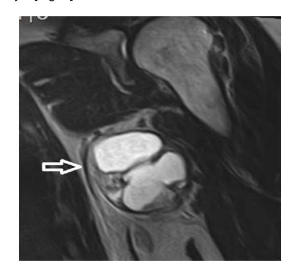
Fig. 1. MRI of left axilla showing the wall of the cyst (large black arrow). The cyst is filled with haemorrhagic blood (white in colour within the cyst wall -- large arrow mark)

The pathologist noted that the outer wall was intact, smooth, and brownish black in colour and size of cut opened specimen was 93 x 83 x 10 mm as seen in the picture. The lumen of the cyst was unilocular and bit irregular without any papillary structures. The wall was thin and smooth. There were some blood clots within the cyst [Fig. 2].