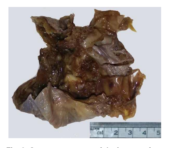
Fig. 2. Gross appearance of the inner surface of the wall showing some blood clots (dark brown)

Few random areas were selected from the gross specimen and processed for microscopic examination. Microscopic features were characterised by a thin and smooth wall, which was composed of fibrous connective tissue lined