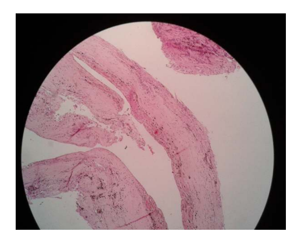
Fig. 3. Microscopic appearance of the cyst wall (H&E stain, X 100). The thin and smooth cyst wall composed fibrous connective tissue lined by flattened epithelium

by very thin and flatten epithelium. Few hemosiderin- laden macrophages were seen in the wall. There were no any papillary structures or any malignant changes in cyst wall [Fig. 3]. Histopathological diagnosis was cystic hygroma with some haemorrhage in the cyst.