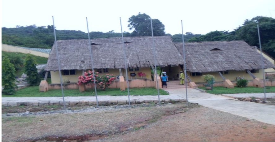
Plate 1. A building showing relaxation centre with walk way at Ikogosi warm spring