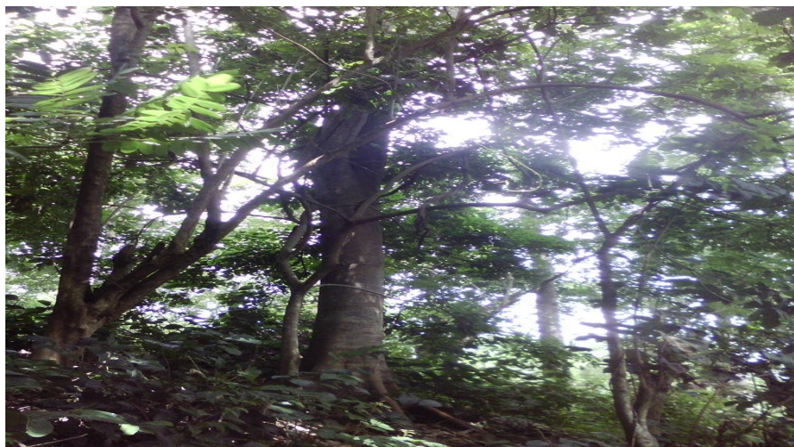
Plate 4. Vegetation in one of the sampled plot in Arinta waterfall watershed