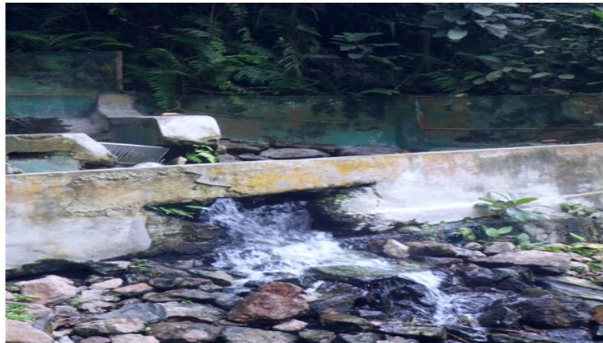
Plate 2. Picture showing the source of warm spring at Ikogosi