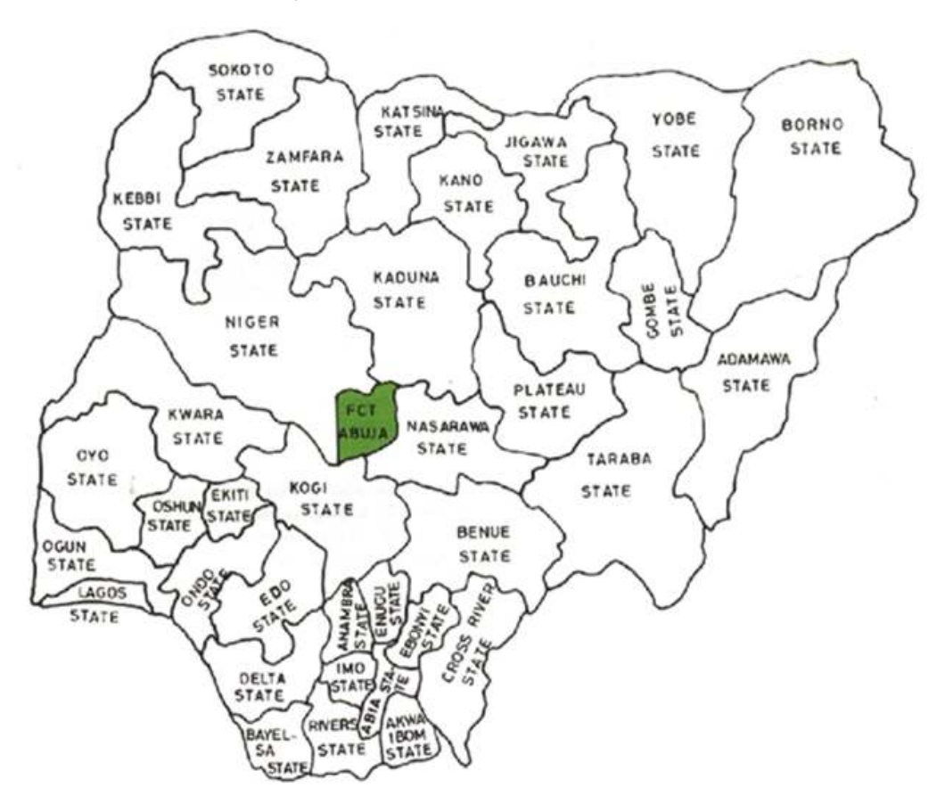
Fig. 1. Map of Nigeria showing states of the federation

2020, the right to sight has as one of its three elements: the human resource development. It has suggested regional HReH targets which are thought to be needed for major reduction in avoidable visual impairment by the year 2020 [1-5].