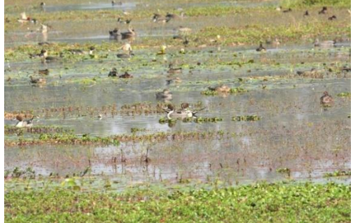
Northern Pintail Anas acuta