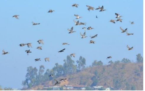
Gadwall Mareca strepera