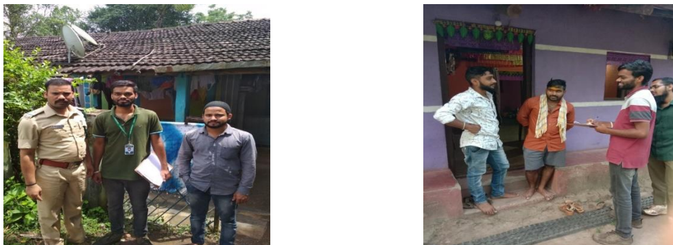
Plate 2. Questionnaire survey with forest officials and household owners