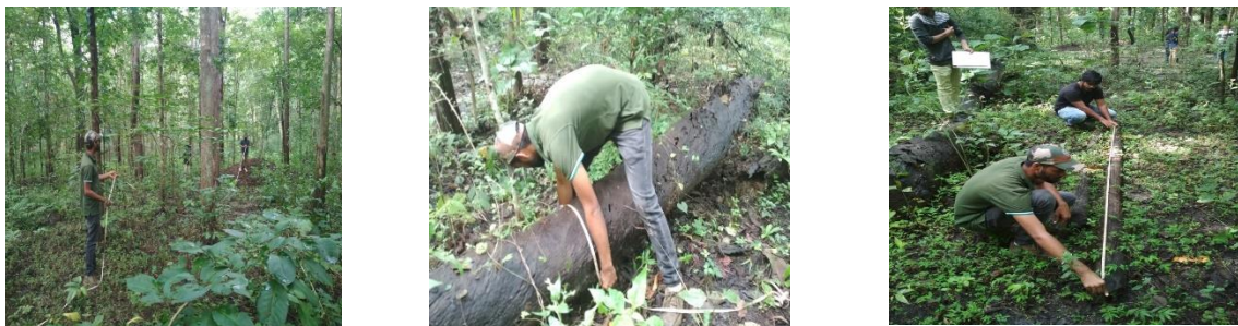
Plate 1. Laying of plots and recording field observations