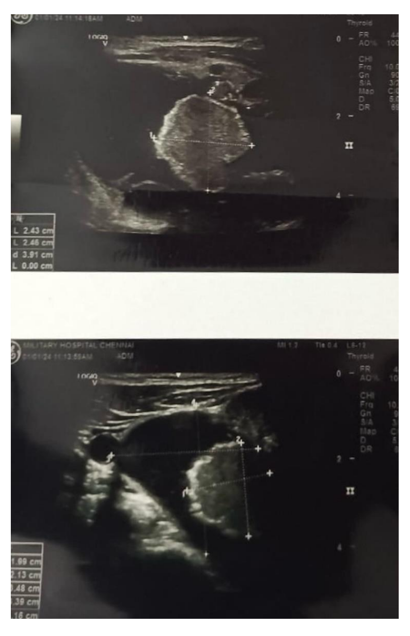
Fig. 1. Ultrasonography of the right lobe thyroid showing a solid and cystic lesion (TIRADS 4). The hypoechoic nodule with wall calcification and punctate echogenic foci

manifests as extensive fibrosis within the thyroid parenchyma. This fibrotic stroma imparts a firm consistency to the tumour, often leading to a misdiagnosis of benign thyroid disease on fineneedle aspiration cytology (FNAC) [5,6]. The presence of classic nuclear features of PTC, including nuclear enlargement, grooves, and pseudoinclusions, is crucial for accurate diagnosis [7]. Additionally, immunohistochemical staining for thyroid- specific markers, such as thyroglobulin and thyroid transcription factor-1 (TTF-1), aids in confirming the thyroid origin of the tumour [8].