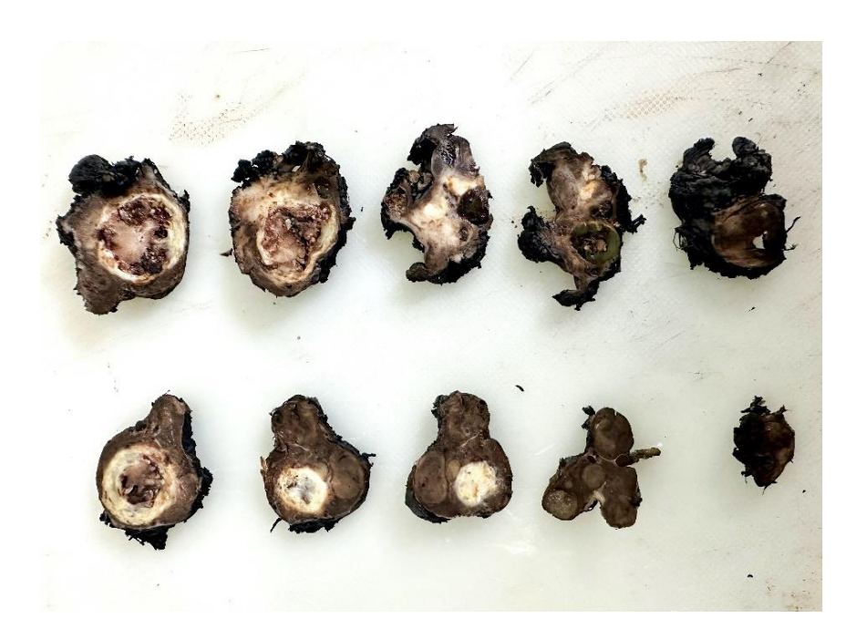
Fig. 2. Serial sections of the right hemithyroidectomy specimen showing an ill circumscribed solid and cystic lesion with areas of necrosis