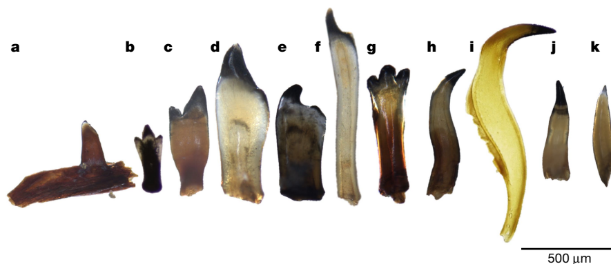
Fig. 3 | Representative fish teeth fossils from multiple taxa as recovered from the sediment cores in Lake Victoria. a , Cyprinoid pharyngeal tooth attached to the jaw bone. b , Haplochromine cichlid oral tooth from an inner tooth row. c , Haplochromine cichlid oral tooth from outer tooth row.

d,e , Haplochromine cichlid pharyngeal teeth. f , Oreochromine cichlid pharyngeal tooth. g , Oreochromine cichlid oral tooth. h,i , Mochokid catfish teeth from the premaxilla tooth pad on the lower jaw. j , Bagrid catfish tooth. k , Clariid catfish tooth.