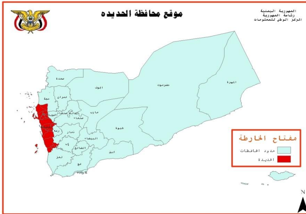
Fig. 1. Map of Yemen, the red area is Hodeidah governorate

After obtaining a consent from the participants, a well trained persons collected data by using a structured questionnaire. The questionnaire used to collect data about the socio-demographic data, knowledge, attitude and practice of mothers towards diphtheria prevention and control. The Data were collected during January 2018 and analyzed using Statistical Package Social Sciences (SPSS) version 23.