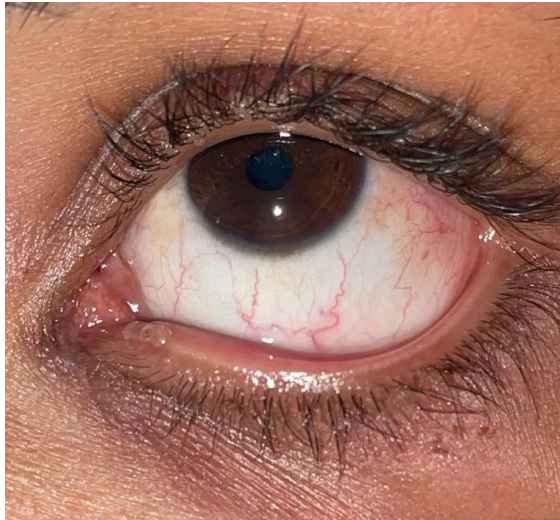
Fig. 5. Appearance at the 4th week of control with good healing of the wound and a fixed and stable flange

Direct and frank section wounds are most often caused by fights [6–8]. The left side is affected in 60% of cases [6] and the inferior canaliculus is most frequently affected [8] since the superior canaliculus is better protected by frontal bony projections.