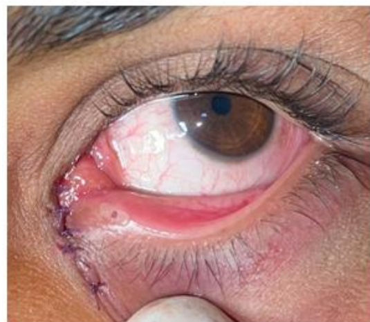
Fig. 4. Repair of the canthus and eyelid wound with polyglactin sutures (7-0 for the deep plane and 6-0 for the superficial plane). We note the stability of the probe by fixing the flange on the lower lacrimal punctum