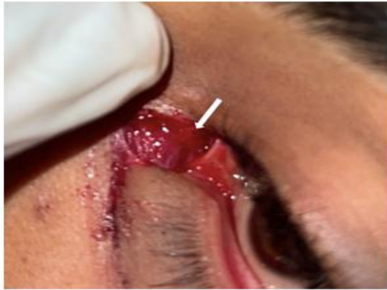
Fig. 1. Medial canthus avulsion with left inferior palpebral wound associated with frank section of the inferior lacrimal canaliculus middle segment, passing 5 mm medial to the inferior meatus, with identification of the internal end of the severed canaliculus (arrow) as a pinkish-white tubular mucosal structure

The patient received topical treatment (3 months of lubricating eye drops and 7 days of antibiotic and corticosteroid eye drops) and oral treatment (8 days of antibiotics and 4 days of corticosteroids).