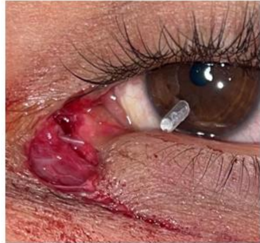
Fig. 3. True mono-canalicular intubation by positioning the flexible mono-canalicular probe, to ensure proper alignment of the anastomosis of the lacerated canaliculus two edges

by simple traction on the collar using forceps (Fig. 6), There is no lacrimation, bone contact is present, lacrimal ducts irrigation is permeable). 3 months later the result remains unchanged.