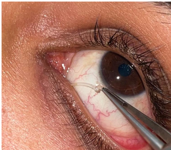
Fig. 6. Removal of the probe under topical anesthesia by simple traction on the flange using forceps. There is no lacrimation, bone contact is present, lacrimal ducts irrigation is permeable

The seat of the anatomical lesion makes it possible to separate lacrimal canalicular wounds into two categories [4–5].