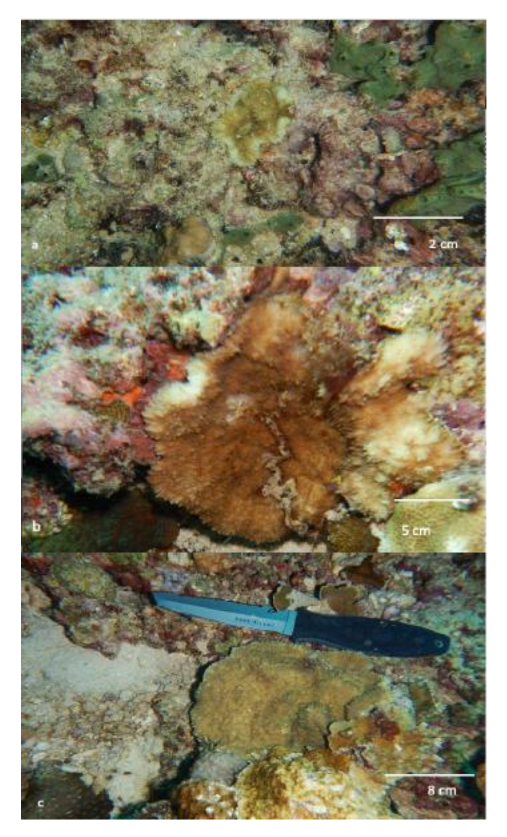
Fig. 2. Podabacia kunzmanni at different depths: a) small (in 4 m), b) large (in 10 m) and c) very large (in 18 m), all attached to coral rock