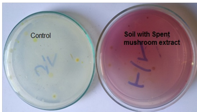
Fig. 2. change in color of agar plats as a result of spent mushroom extract amendment to the experimental soil