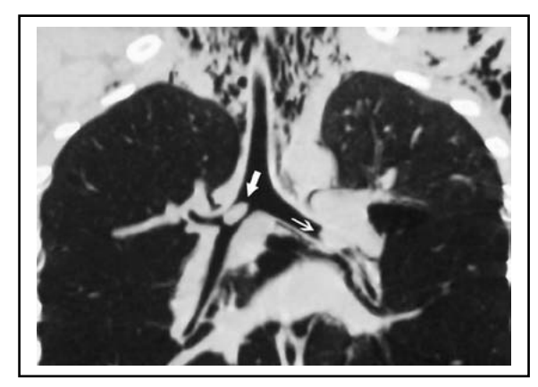
Fig.1: Three-dimensional reconstruction chest CT confirmed bilateral bronchial foreign body. The white arrow indicates the foreign body in the right bronchus and the black arrow indicates the foreign body in the left bronchus.

bronchial foreign body (Fig.1). Retrieval of the bronchial foreign bodies was performed shortly after admission under combined intravenous anesthesia and high-frequency positive-pressure ventilation. We first attempted to retrieve the cocklebur fruit in the right main bronchus because of its location near to bifurcation of the trachea and relative accessibility. However, during the operation, the cocklebur fruit in the right bronchus was pushed to a deeper level by the trielcon. The rigid bronchoscope was then passed into the right bronchus followed the foreign body pushed even further, and the patient's blood oxygen saturation declined rapidly from 90% to 15%. At that time, the only option that would save the child's life was to retrieve the right bronchial foreign body as quickly as possible. Fortunately, we were able to extract the foreign body in the next 30 seconds using a crocodile clamp, and oxygen saturation quickly returned to 90%. We then successfully extracted the left bronchial cocklebur fruit and the child was discharged on postoperative day two.