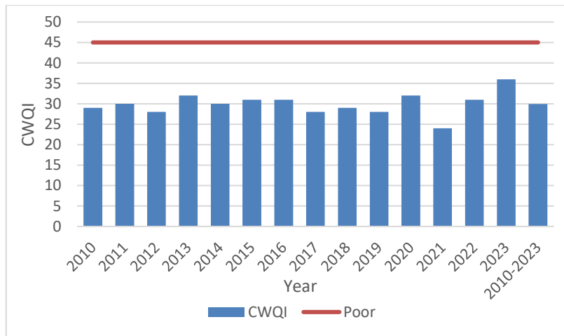
Fig. 2. Canadian Overall Water Quality Index (CWQI) for Lake Chapala by year and over the entire period 2010-2023