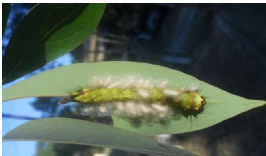
Fig. 3. Larvae infested by A. glomeratus

To mitigate Apanteles glomeratus infestation: Employing a nylon mosquito net during silkworm rearing stands out as an effective preventive measure against infestations. Keeping the rearing area clean and applying bleaching powder are essential practices for controlling infestations. Additionally, it is imperative to diligently collect and dispose of maggots, pupae, and any silkworm larvae affected by infestation to prevent further spread.