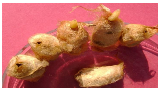
Fig. 2. Uzi fly infested damaged silkworm cocoons

Pupa: The pupae of Uzi fly exhibit an oblong shape with a rounded posterior end. They range in color from light reddish-brown to dark reddish-brown. The pupal body comprises 11 segments and measures between 0.9 to 1.2 cm in length and 0.4 to 0.6 cm in lateral width. Adults typically emerge 10-12 days after pupation [6].