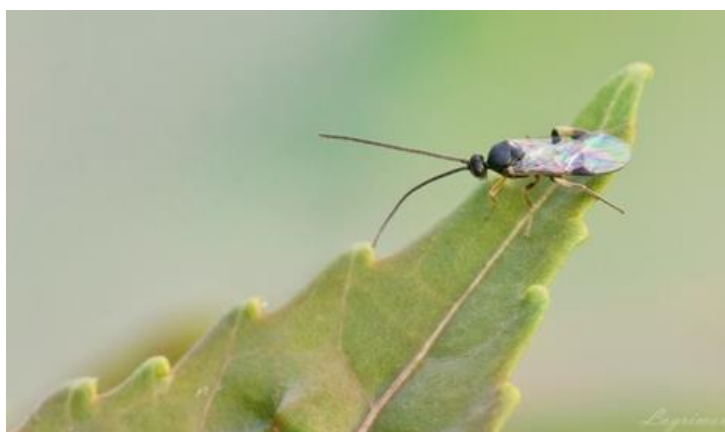
Fig. 4. A. glomeratus adult fly