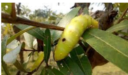
Fig. 1. Uzi fly infected Muga silkworm larva