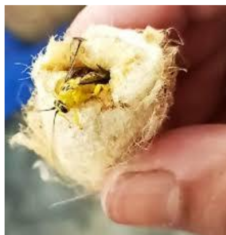
Fig. 7. Xanthopimpla pedator infected Muga silkworm cocoon

To manage wasp infestations: Rearing silkworms under a nylon net and utilizing mechanical control methods stand as the primary preventive measures. Additionally, managing insects that produce honeydew, such as aphids, can indirectly decrease wasp attraction.