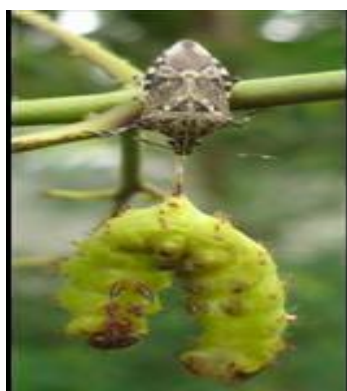
Fig. 6. Eocanthecona furcellata infected Muga silkworm larva

To manage bug infestations: Rearing silkworms under a nylon net and utilizing mechanical control methods are highly recommended strategies. Additionally, the introduction of Psix striaticeps , a parasitoid, can effectively serve as a biological control agent against the sting bug. These measures collectively contribute to a comprehensive approach in managing pests and ensuring the healthy development of silkworms.