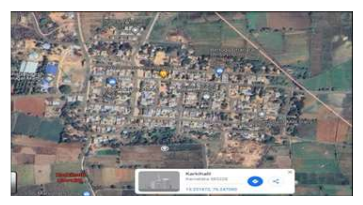
Fig. 1. Google map of Karkihalli village, Koppal

Naveesh et al.; Asian J. Env. Ecol., vol. 22, no. 4, pp. 104-114, 2023; Article no.AJEE.110337