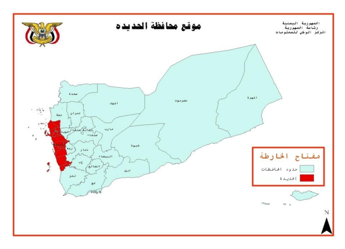
Fig. 1. Map of Yemen, the red area is Hodeidah governorate

After obtaining a consent from the participants, a well trained persons collected data by using a structured questionnaire. The questionnaire used to collect data about the socio-demographic data, knowledge, attitude and practice of mothers towards diphtheria prevention and control. The Data were collected during January 2018 and analyzed using Statistical Package Social Sciences (SPSS) version 23.