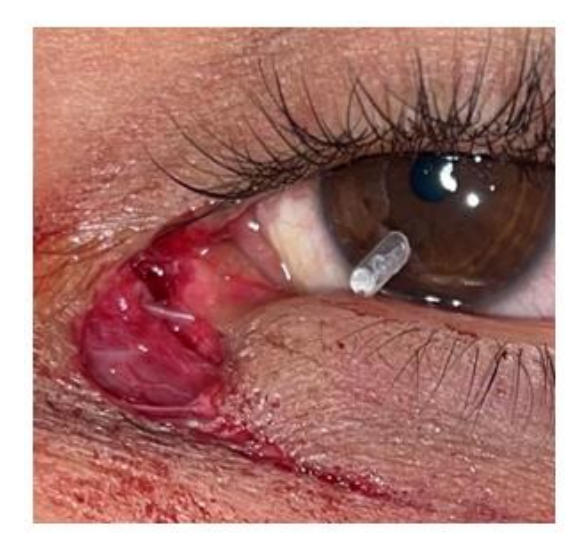
Fig. 3. True mono-canalicular intubation by positioning the flexible mono-canalicular probe, to ensure proper alignment of the anastomosis of the lacerated canaliculus two edges

by simple traction on the collar using forceps (Fig. 6), There is no lacrimation, bone contact is present, lacrimal ducts irrigation is permeable). 3 months later the result remains unchanged.