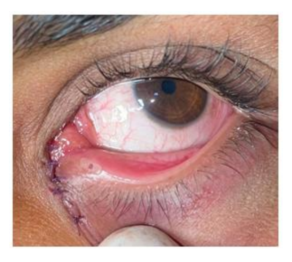
Fig. 4. Repair of the canthus and eyelid wound with polyglactin sutures (7-0 for the deep plane and 6-0 for the superficial plane). We note the stability of the probe by fixing the flange on the lower lacrimal punctum