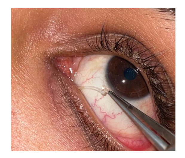
Fig. 6. Removal of the probe under topical anesthesia by simple traction on the flange using forceps. There is no lacrimation, bone contact is present, lacrimal ducts irrigation is permeable

The seat of the anatomical lesion makes it possible to separate lacrimal canalicular wounds into two categories [4–5].