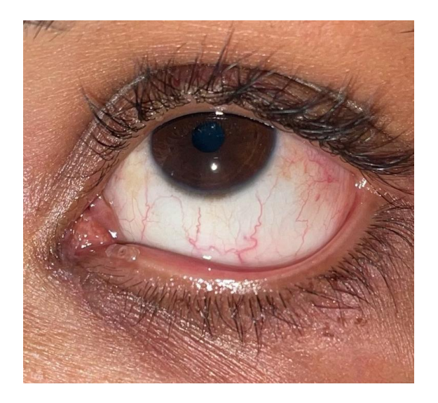
Fig. 5. Appearance at the 4th week of control with good healing of the wound and a fixed and stable flange

Direct and frank section wounds are most often caused by fights [6–8]. The left side is affected in 60% of cases [6] and the inferior canaliculus is most frequently affected [8] since the superior canaliculus is better protected by frontal bony projections.