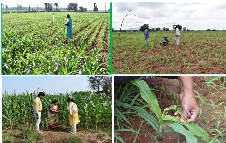
Fig. 2. OFT on management against fall army worm