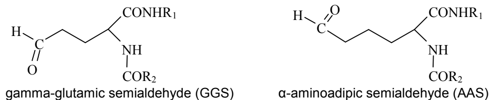
Fig. 1. The structures of the most investigated carbonyl derivatives

The most investigated carbonyl derivatives are represented by gamma-glutamic semialdehyde (GGS) generated from the degradation of arginine residue and \alpha -amino adipic semialdehyde (AAS) derived from lysine Fig. 1 [9].